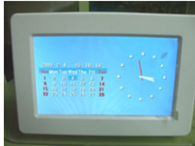
Calendar + Clock

By factory setting, a calendar with an analog clock will display when being power connected. Insert the appropriate memory card, or USB Flash Disk into respective slot, the unit will automatically display the stored photos.